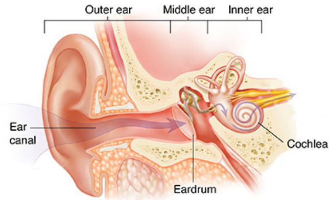
Figure 1. Human ear anatomy (adapted from [1]).