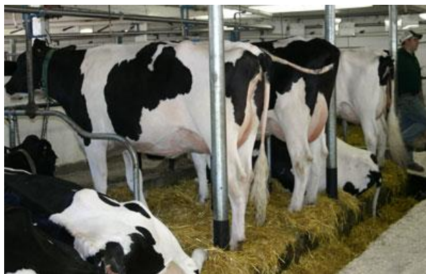
Figure 1: Holstein Cows in a Tie-Stall Barn [Holstein2019]

Tim, the Midwestern dairy farmer, has a problem. He doesn't make any money selling milk. Unfortunately, he barely breaks even after expenses with the average market value of 100 pounds (just under 12 gallons) of milk selling for around $15 [Tebbe2019]. It is hard to make a living under those dire circumstances. To combat this, he has developed an exceptional breed of Holstein cattle. These cattle are sought after by large dairy farms who want superior stock without the work of raising the calves until they are "fresh" (recently given birth to a calf and ready to milk). About 90% of the 9 million dairy cows in the United States are Holsteins. [Holstein2019]